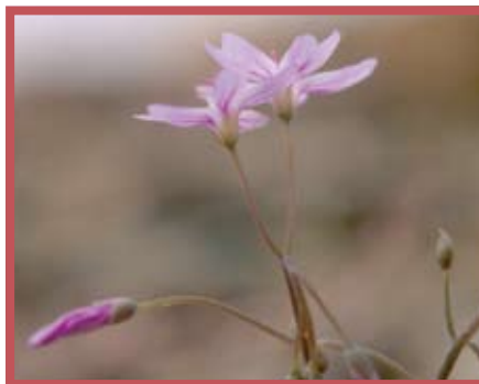
Gypsum Spring Beauty