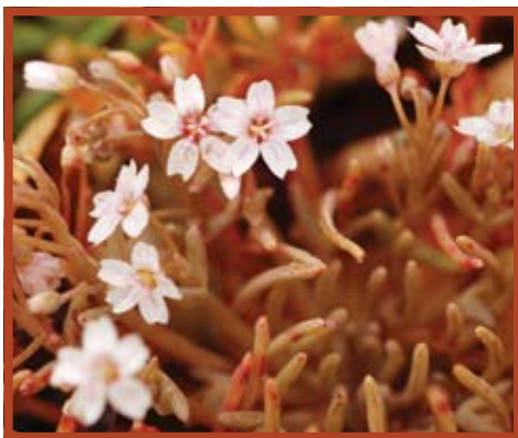
Little Spring Beauty